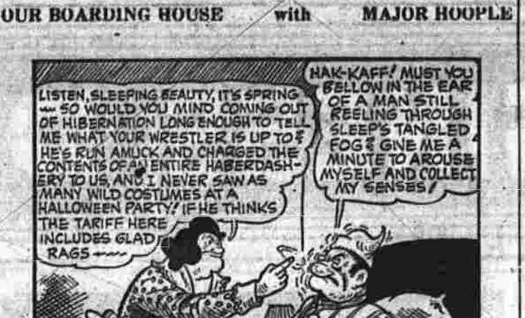
OUR BOARDING HOUSE with MAJOR HOOPLE